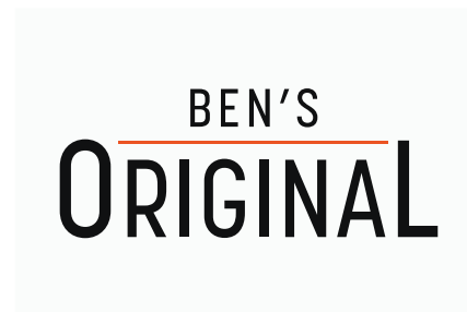
SECONDARY DARK LOGO