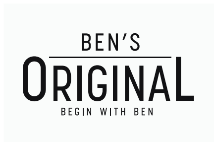
MONO DARK LOGO