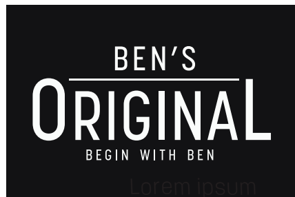
MONO LIGHT LOGO