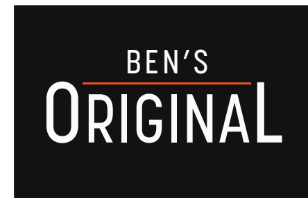
SECONDARY LIGHT LOGO